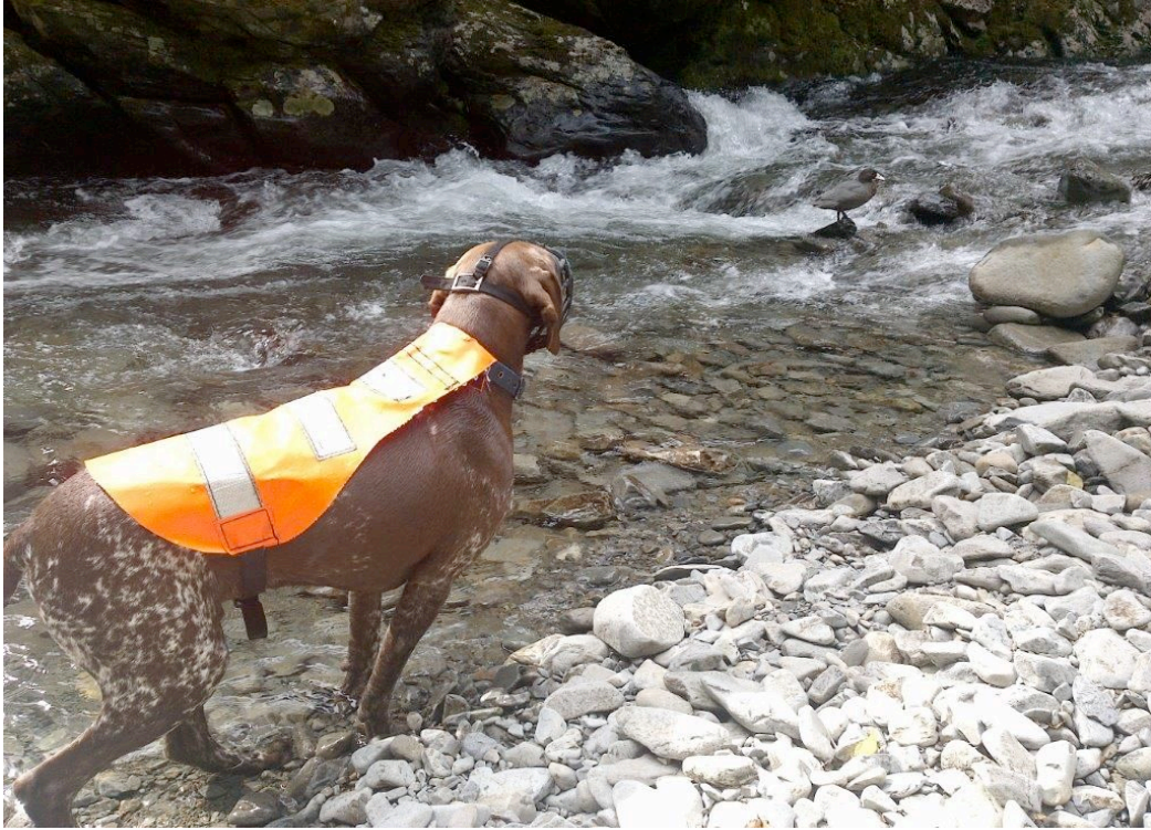
Species dog "Fenn" on the Wangapeka survey. Follow his nose to the whio.