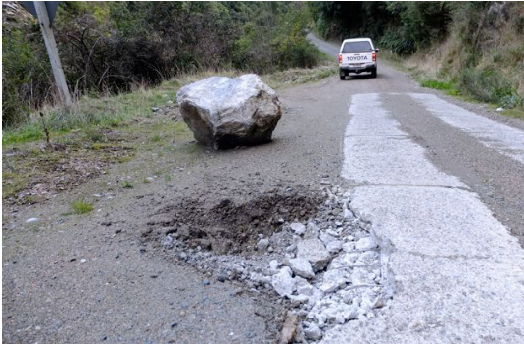
You would not have wanted to be around when this happened. Scene: the concrete strips, Graham Valley Road, June 2017